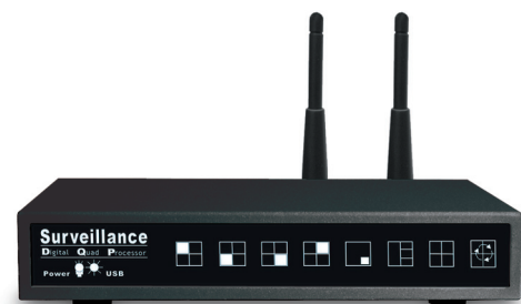
DQP-W2A2 (2 Wireless and 2 analog)